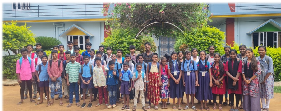
Group of children at Ray's of Peace home (near Bangalore, India) where the CAWS Team installed a water purification system May, 2024. It included softening the water then sending it through reverse osmosis.

To increase the academic and professional abilities of participants, their vocational vision for lifelong servant-leadership and their courage to act on convictions