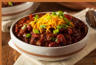
CHILI COOK-OFF 5-6 PM