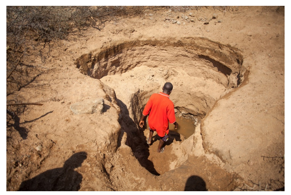
MCC photo/Matthew Sawatzky

By Kimberly Tucker, Mennonite Central Committee advocate