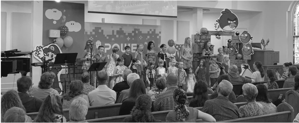
VBS Review and Mini-Concert Sunday, July 21, 2019