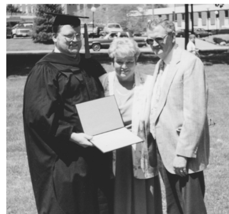
Seminary Graduation May 1994

At my dad's funeral there were people from all walks of life—wealthy and poor, able and disabled, highly educated and not so well educated, people who knew Dad as their supervisor at Westinghouse and people who knew him as a janitor at the local hospital. The young were there together with the old. Some of the people there he had visited in the hospital, and some he had led to the Lord. They were all there because they had experienced the gospel of according to John.