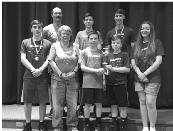
Allegheny Open Second Place Quizzers

The Charlie Crider Memorial Bible Quizzing Tournament will be Saturday, May 5 at Elizabethtown BIC church . This will be an all-day event. We will be quizzing on 1 Corinthians Chapters 1-16 and 2 Corinthians chapters 1-11.