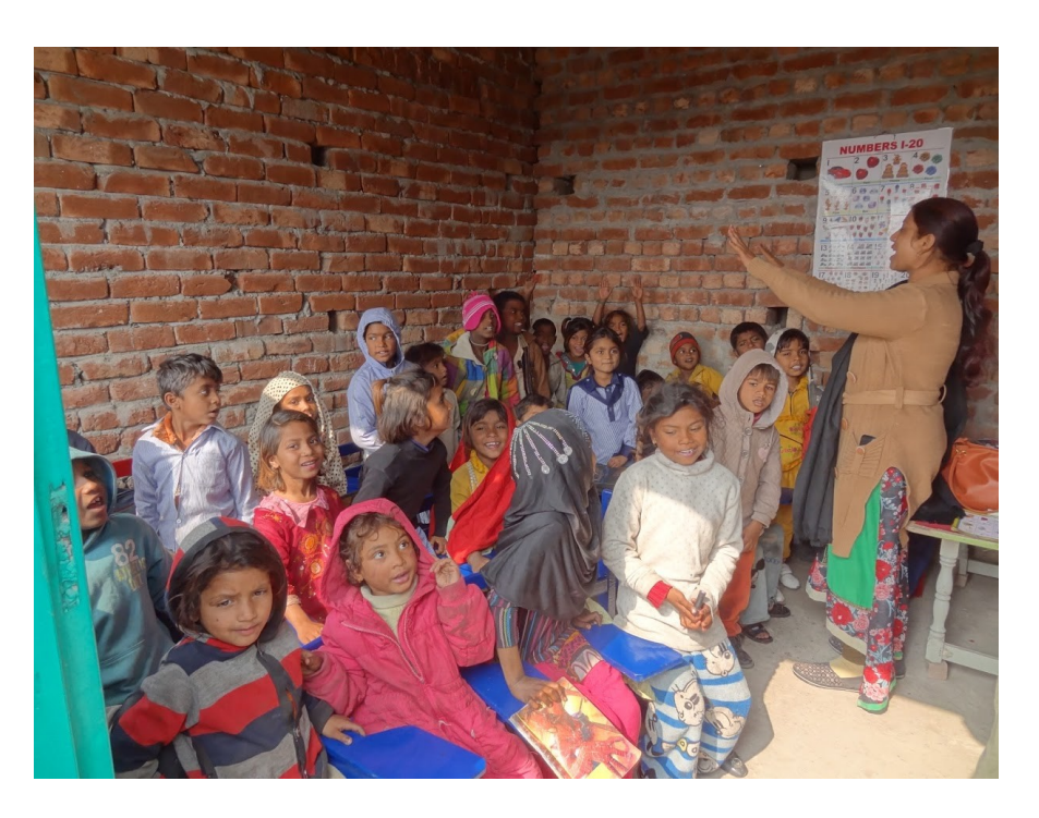
A Full Gospel Assembly Primary School meeting in Pakistan .....bringing hope and education to Pakistan

The vision of Peace Promise is to see women set free from oppression, exploitation, hopelessness, and slavery. They are engaged head on in the battle against the dark world of human trafficking and exploitation. Their efforts are seeing women being transformed, living fulfilled lives with meaningful relationships and employment and finding enduring peace from the Prince of Peace.