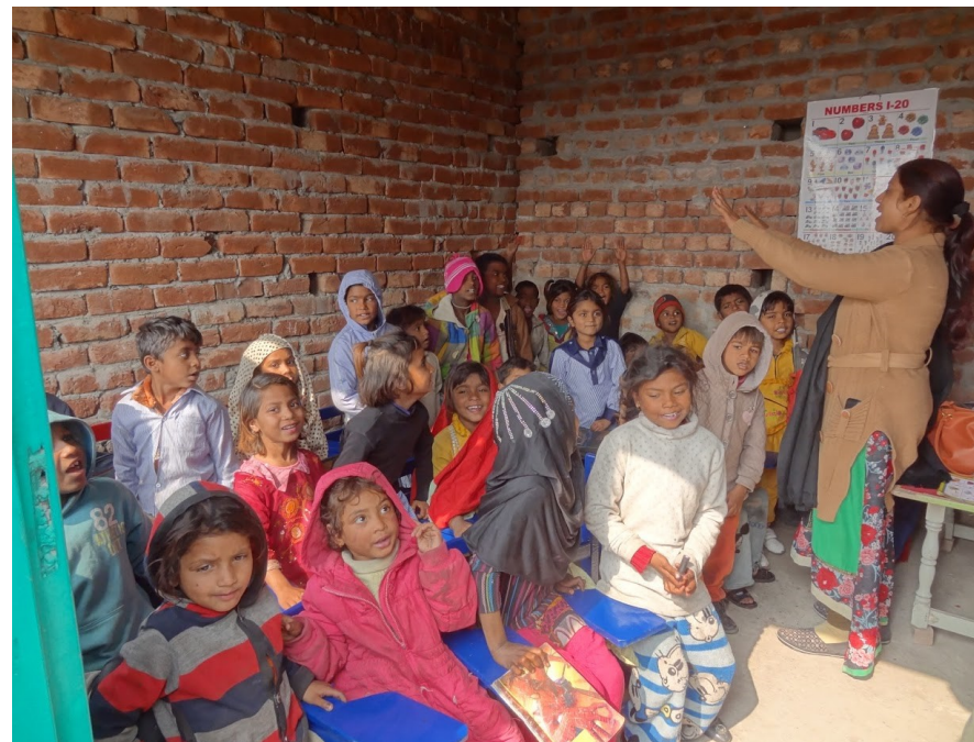
A Full Gospel Assembly Primary School meeting in Pakistan .....bringing hope and education to Pakistan

The vision of Peace Promise is to see women set free from oppression, exploitation, hopelessness, and slavery. They are engaged head on in the battle against the dark world of human trafficking and exploitation. Their efforts are seeing women being transformed, living fulfilled lives with meaningful relationships and employment and finding enduring peace from the Prince of Peace.