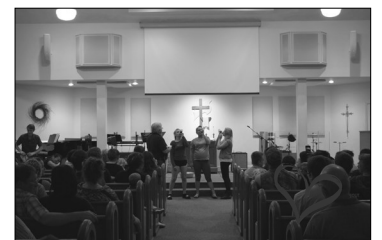
Scenes from September Corner Life!