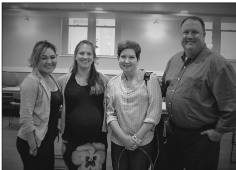
Family Promise of Harrisburg Capital Region (Left to Right)