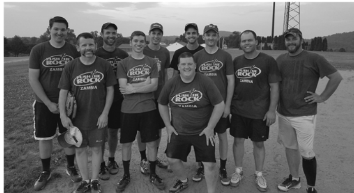
Dillsburg BiC Men's Softball Team July 20, 2017