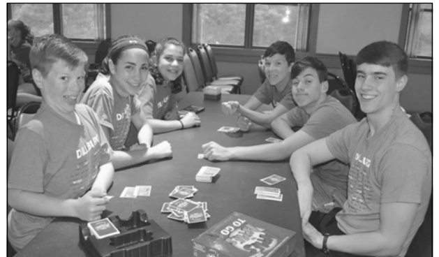
Quizzers relax playing “Apples to Apples” during a break.