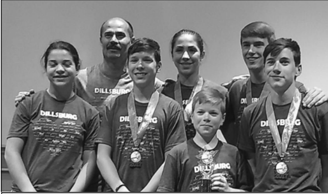
The Dillsburg BIC Quizzers won first place at Denominational Finals, their fourth consecutive top win!

Dillsburg won its fourth championship in a row at Denominational Round Robins and Finals, tying us with Pilgrim Chapel from New York (1981-1984) for the most wins in a row. It was also Dillsburg's 5 th overall win.