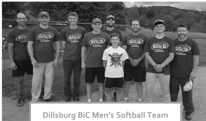
Dillsburg BiC Men's Softball Team June 6, 2017